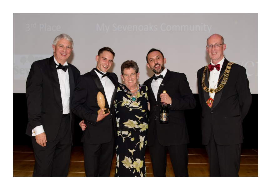
Customer Choice Award sponsored by Specsavers